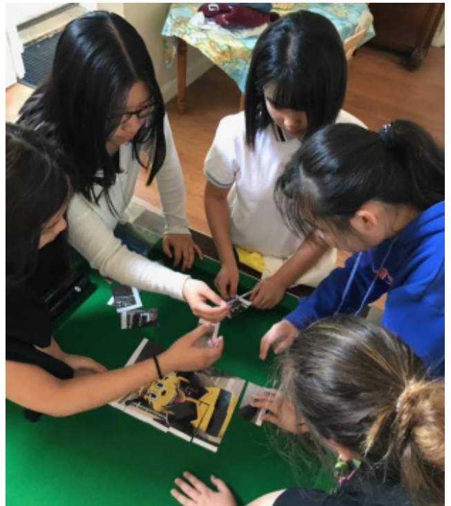
The winning team piecing together the clues to earn their prize.