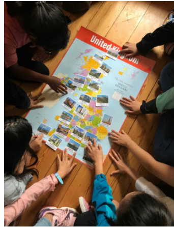
Miss Smith's Geography puzzle.