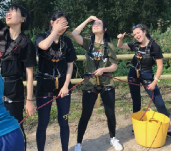
6th form girls watching their friends jump for the trapeze!