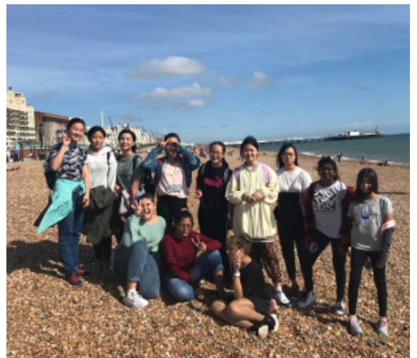
A group photo on Brighton beach.