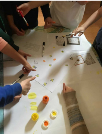
Bumble bee finger painting.