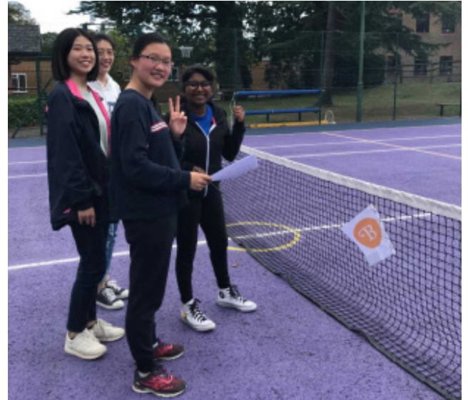
Out and about around the school finding the clues.