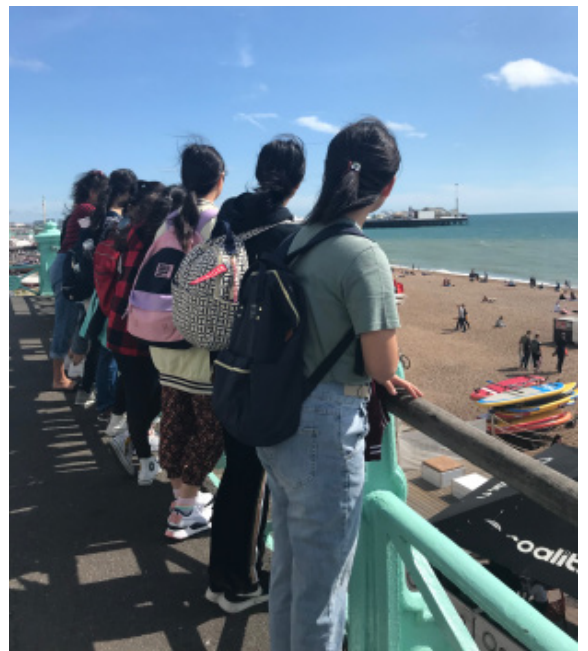
The Year 7 and 8 girls enjoying the view.

We woke the girls on Saturday 31st August at 6am and there was more than one grumpy face, but these were