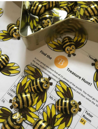
Delicious treasure hunt prizes.