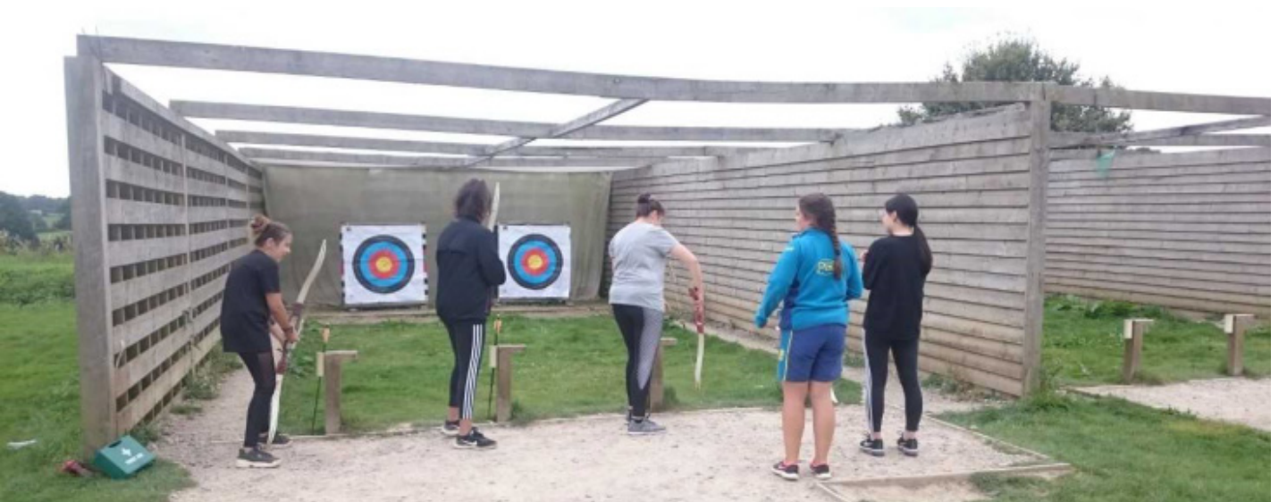
Trying our best at Archery.