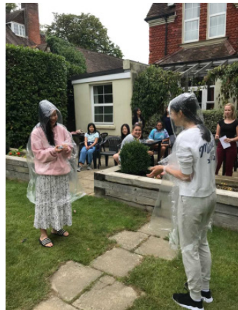
Fun with water balloons