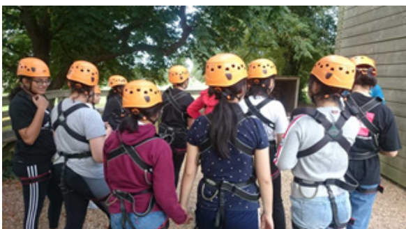
Listening carefully to the safety briefing.

soon replaced with plenty of smiles and excited chatter when we arrived at PGL centre in Hailsham, for an exciting weekend full of adventures. On the agenda was abseiling, aero ball, fencing, zip lining, archery, trapeze, giant swing, and a tunnel maze. Our girls really proved just how bold “tomorrow’s women” are as they climbed, bounced, leapt and swung their way through the weekend. We are so proud of all the girls; how polite they were to the PGL staff and how they enthusiastically took part in each activity.